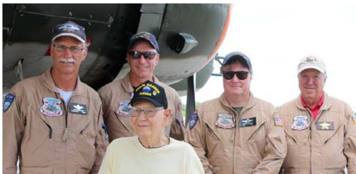
Pearl Harbor survivor gets a ride in the B-25