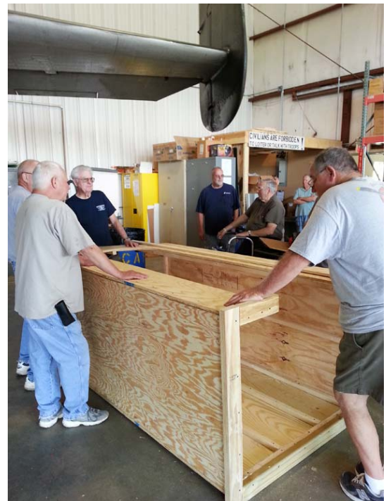
Guard shack being constructed.