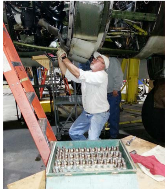
B-25 spark plug replacement.