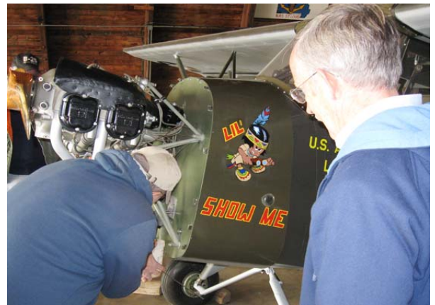
L3 getting all new weather seals.