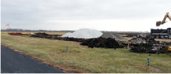
Building starts on new private hangar next to the B-25 hangar.