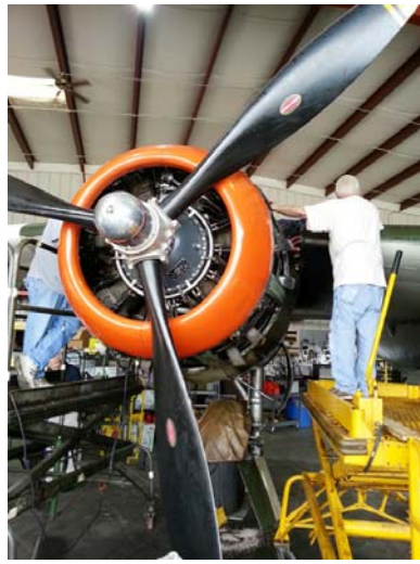
B-25 engine mount replacement.