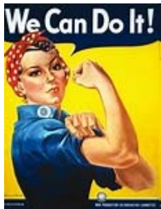
Rosie the Riveter

Rosie the Riveter is a cultural icon of World War II, representing the women who worked in factories and shipyards during World War II, many of whom produced munitions and war supplies. These women sometimes took entirely new jobs replacing the male workers who joined the military. Rosie the Riveter is used as a symbol of American feminism and women's economic power.