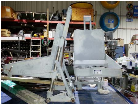
New B-25 Waist Gunner Seats