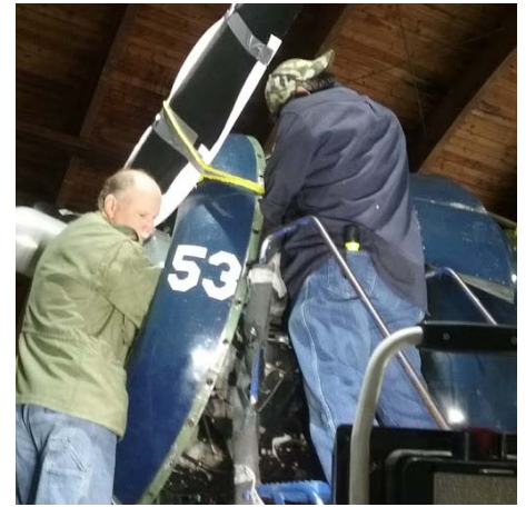
TBM cylinder replacement.