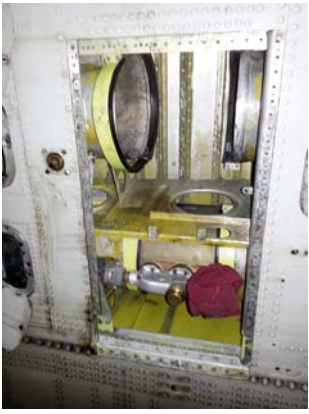
B-25 oil cooler sent out for repairs.