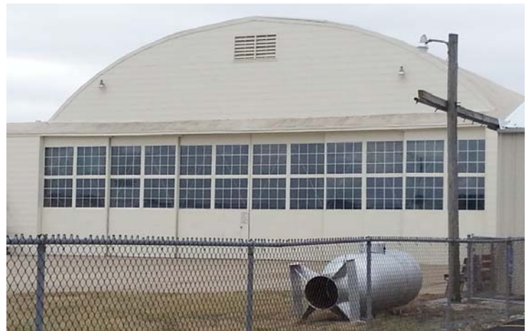
Front of the wooden hangar after updates. Just waiting for the signage.

The B-25 and TBM are both in the middle of their annual inspections getting ready for the airshow season.