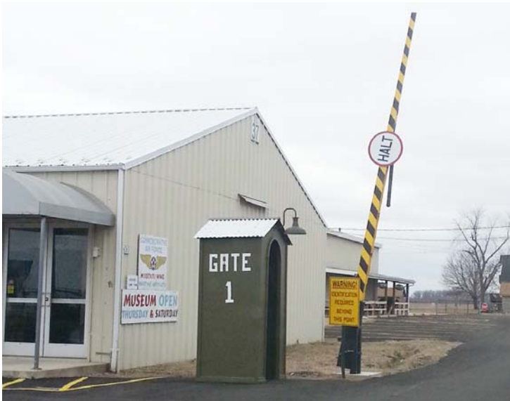
New guard house and gate.