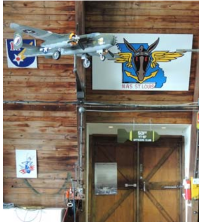
B-25 model hanging mounted above the O'Club doors.