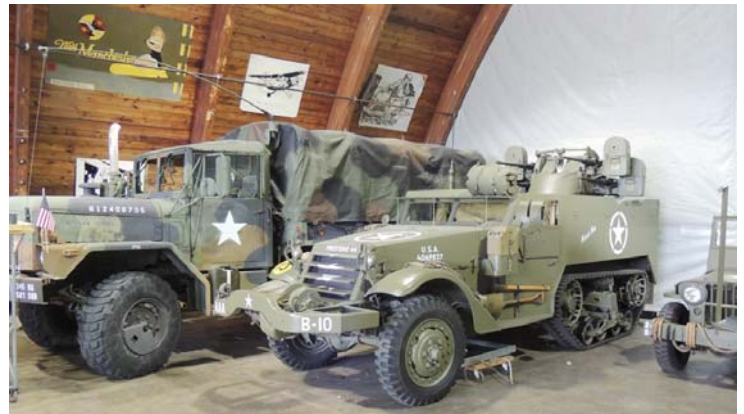
New attraction for the hangar - WWII Half-Track with Anti-Aircraft Quad 50's.