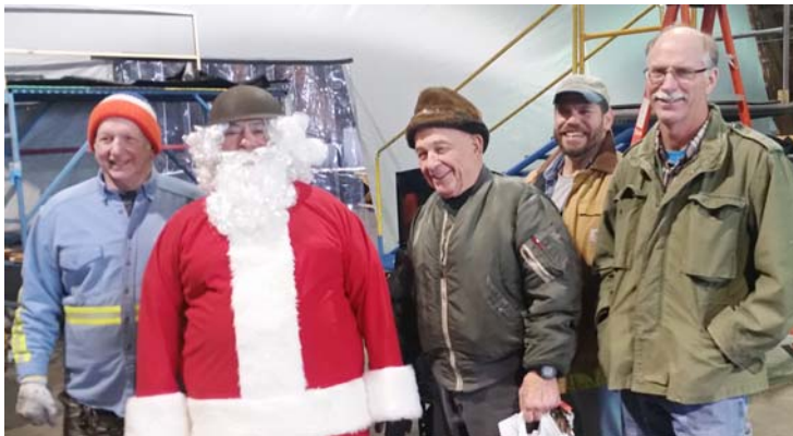
A surprise visit from Santa brought Christmas cheer to Smartt Field.